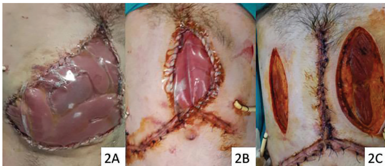
Fig. 2. Closure of the open abdomen with multiple sessions (A-B-C)