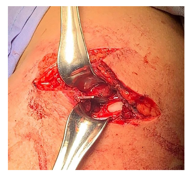
Fig. 2. Intraoperative image demonstrating the knife blade penetrating the proximal humerus.

stab wound, allowing circumferential access to the humeral shaft, performing a lateral incision on the deltoid area, extending it proximally and distally, exposing the foreign body entry point. The broken piece of the blade was pressed with the surface of the bone and was strongly fixed in the area of the crest of the greatest tubercle of the humerus (Figure 2). The humeral artery was unharmed, with an adequate pulse. No lesions to the axillar, radial, or ulnar nerve were seen. Neurological examination of the left upper extremity revealed no motor or sensory deficits. We were not able to pull it out with any surgical instrument, so with the aid of an orthopedic surgeon, the surrounding bone tissue was osteotomised