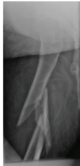
Fig. 2. Anteroposterior (AP) and Lateral radiograph post-failed fixation revealing a comminuted femoral fracture.

The surgical technique employed was that of a standard femoral nail technique. The patient is placed supine on a traction table. Fluoroscopy is employed to gain as best reduction by manipulating the limb as can be achieved. Following skin preparation and draping, a small incision is made proximal to the greater trochanter. Through this, the greater trochanter entry point is placed with use of a guide wire, over which the entry reamer for the proximal portion of the nail is used.