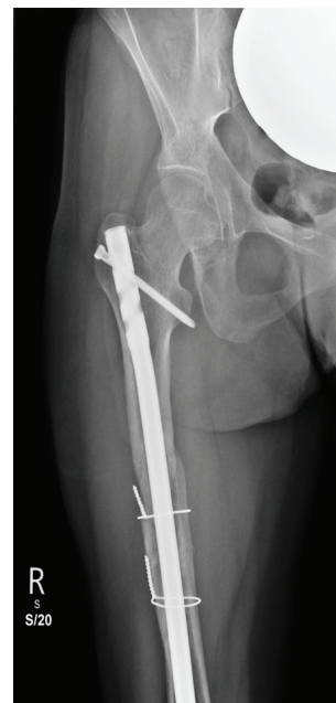
Fig. 3. Anteroposterior (AP) and lateral radiograph post-revision fixation demonstrating the intramedullary nail revision with open reduction and cerclage wiring.