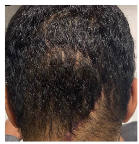
Fig. 2. Post-operative photograph taken from well healed wound of a patient. No sign of wound complication is visible.

Suboccipital craniotomy through a midline skin incision has been the most extensively accepted surgical approach for achieving pathologies in the posterior fossa and CVJ [3, 4, 7]. Using this approach, the surgeon and the patient might experience difficulties, which we attempted to solve with our novel technique. In this technique, a question markshaped incision is performed rather than a midline incision in an avascular plan, which primarily makes a well-vascularized musculocutaneous flap supplied by the occipital artery. Therefore, it improves the wound-healing process by enhancing the blood supply. Moreover, the incision begins at the level of the C1 vertebra and is not extended to the C2 vertebra, where the origins of suboccipital muscles such as rectus capitis posterior major and obliquus capitis inferior are located [15]. As a result, these muscles remain virtually intact, reducing the risk of damage and maintaining neck stability. In this new incision, the pathway of the muscular incision provides a wide area for craniotomy with adequate