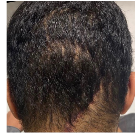
Fig. 2. Post-operative photograph taken from well healed wound of a patient. No sign of wound complication is visible.

Suboccipital craniotomy through a midline skin incision has been the most extensively accepted surgical approach for achieving pathologies in the posterior fossa and CVJ [3, 4, 7]. Using this approach, the surgeon and the patient might experience difficulties, which we attempted to solve with our novel technique. In this technique, a question markshaped incision is performed rather than a midline incision in an avascular plan, which primarily makes a well-vascularized musculocutaneous flap supplied by the occipital artery. Therefore, it improves the wound-healing process by enhancing the blood supply. Moreover, the incision begins at the level of the C1 vertebra and is not extended to the C2 vertebra, where the origins of suboccipital muscles such as rectus capitis posterior major and obliquus capitis inferior are located [15]. As a result, these muscles remain virtually intact, reducing the risk of damage and maintaining neck stability. In this new incision, the pathway of the muscular incision provides a wide area for craniotomy with adequate