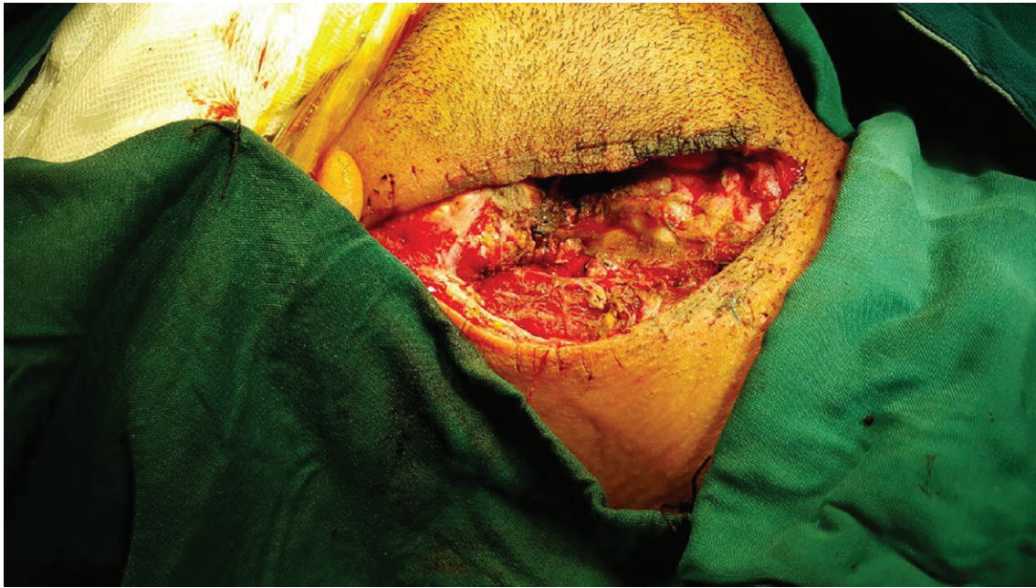
Fig. 3 The intraoperative image demonstrating the aneurysm in distal segment of the internal carotid artery after reoperation.

internal carotid artery without any aneurysm residue. The patient received anticoagulation for 3 months and was followed in outpatient clinic. After 1 year of follow-up he was completely asymptomatic and the angiogram revealed patent parent vessel without residue. The patient and his family provided their informed written consent for publication of the case and the images.