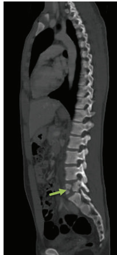
Fig. 1. Sagittal Computed Tomography (CT) scan of the whole spine showing burst fracture at L5 (arrow) with canal compromise (Magerl A3).

On day four post-admission, an emergency consultation call was sent to our intensive care unit (ICU) in view of patient's deteriorating status. When seen, he was grossly pale and febrile at 101 F, pulse rate of 140 per minute, systolic blood pressure of 80 mmHg and respiratory rate of 32 per minute maintaining oxygen saturation around 90% on oxygen face-mask. Patient's GCS was 15. Chest auscultation revealed bilateral diffuse coarse crepitation and he was immediately transferred to the ICU. Initial arterial blood gas (ABG) showed partial pressure oxygen (pO 2 ) of 49mm Hg on oxygen by face mask. Patient was intubated, sedated, paralyzed