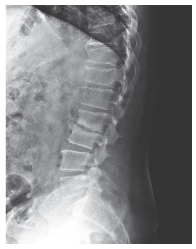
Fig. 1. Lateral radiograph of the lumbosacral spine with marked reduction of L2/L3 intervertebral space associated with marked irregularity of the endplates and vertebral body sclerosis.

Two days after discharge from Hospital (following an admission due to NSAID related upper GI bleeding and cannula-induced phlebitis in his left arm), his back pain recurred with similar features to his initial presentation. Patient was commenced on tramadol, paracetamol, and corticosteroids by his general practitioner. Unfortunately, his back pain did not improve and two weeks later he re-attended the emergency department. On examination, the patient again had no saddle/perineal hypoesthesia or anaesthesia, neither any bowel or bladder disturbances nor symptoms suggestive of cauda equina. During this admission, plain film lateral lumbar spine X-rays (Figure 1) showed marked reduction of L2/L3 intervertebral space associated with significant irregularity of the endplates and also vertebral body sclerosis. The on-call orthopaedic surgeon recommended outpatient follow-up with MRI and to continue a decreasing steroid regimen, and the patient was discharged once again. One week later, the patient developed moderate to severe back pain, which was now only temporarily relieved by opioids and muscle relaxants. The general practitioner requested blood tests and a bone scan. Blood tests showed raised inflammatory markers including CRP. Subsequently, the patient was admitted once again to the rheumatology unit three weeks later, where initial investigations revealed a normal abdominal ultrasound scan and otherwise normal bloods. A