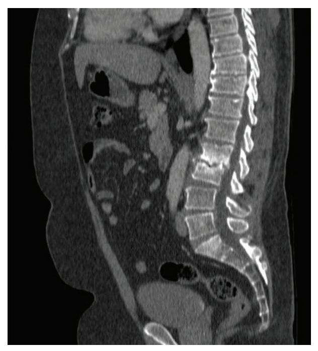
Fig. 2. Sagittal lumbosacral contrast enhanced Computed Tomography (CT) Scan showing marked irregularity of the disc space and vertebral endplates in the L2/L3 interspace. Discrete posterior disc protrusion in L2/L3 interspace. Degenerative signs in the rest of the spine with osteophytes on the anterior margin of vertebral bodies in the last dorsal vertebrae.

Spondylodiscitis, or vertebral osteomyelitis, is