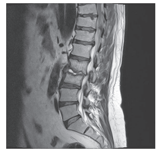
Fig. 3. Sagittal Magnetic resonance imaging (MRI) showed loss of intervertebral disc space at L2/L3, with an irregular high intensity area at L2 suggesting a fluid collection extending to adjacent soft tissues. With slight predominance on the left, leaving adjacent to the psoas, the collection has a foraminal component that compresses the left root. Marked bone irregularity of adjacent joint plates, signs of sclerosis associated with extensive bone oedema in L2/L3 vertebral bodies, and soft tissue

an uncommon diagnosis in the developed world, representing 2-4% of all cases of osteomyelitis [3] and affects mainly adults. One of the most recent case series outlines its appearance in older patients (mean age 50-60 years) with a clear predominance in the male sex [3,4]. Common predisposing factors include diabetes, immunosuppression, and active neoplasia. Postoperative forms may present in patients with a history of spinal surgery or trauma. Risk factors are shown in Table 1. The annual incidence ranges from