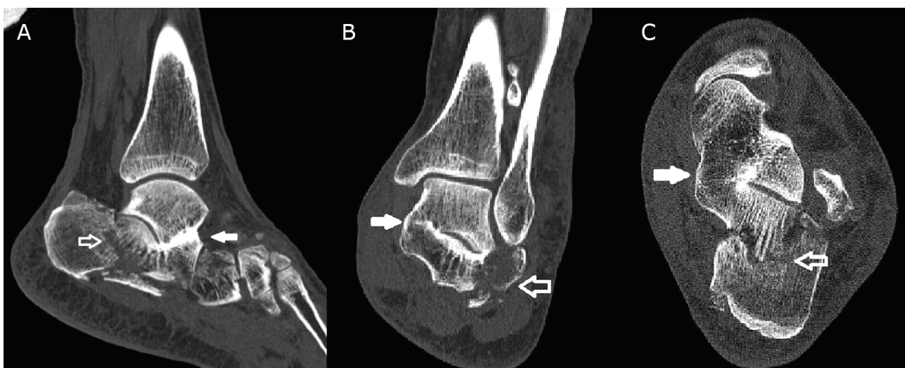
Fig. 2. The sagittal (A), coronal (B) and axial (C) ankle CT scans showing the calcaneal fracture (white arrow) and the coalition of the middle facet (filled white arrow) of the subtalar joint.