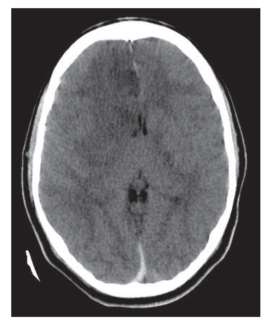
Fig. 1. The initial brain CT-Scan of the patient demonstrating generalized brain edema, left frontal contusion and posterior interhemispheric subdural hematoma.

A 13-year-old boy referred to our center by emergency service following multiple trauma due to a Motor-vehicle accident; his father and brothers expired in the same accident. On arrival, he had GCS 6/15 (M: 4; V: 1; E: 1), bilateral sluggish papillary response to the light and significant respiratory distress due to severe lung contusion. He had fractures in both lower extremities long bones and severe facial injury because of mid-facial trauma. The brain CT-Scan revealed generalized brain edema, left frontal contusion and posterior interhemispheric subdural hematoma (Figure 1). The patient was transferred to the operating room and a ventriculostomy catheter for closed monitoring of ICP was inserted. His average ICP in a 24-hour period was 26 mmHg despite receiving medical therapies for intracranial hypertension. Thus, we reassessed the patient condition and decided to control his intracranial hypertension by a surgical technique. It was decided to insert a draining catheter in the basal cisterna to evacuate the cerebrospinal fluid (CSF). The patient was placed in supine position with his head slightly turned to the left. Supraorbital craniotomy was carried out and the dura was opened on the base of the orbital rim. We observed severe cerebral edema that was resistant to all methods of neuroanesthesia (Figure 2A). Then, through microscopic subfrontal approach, we exposed the basal cisterna. After