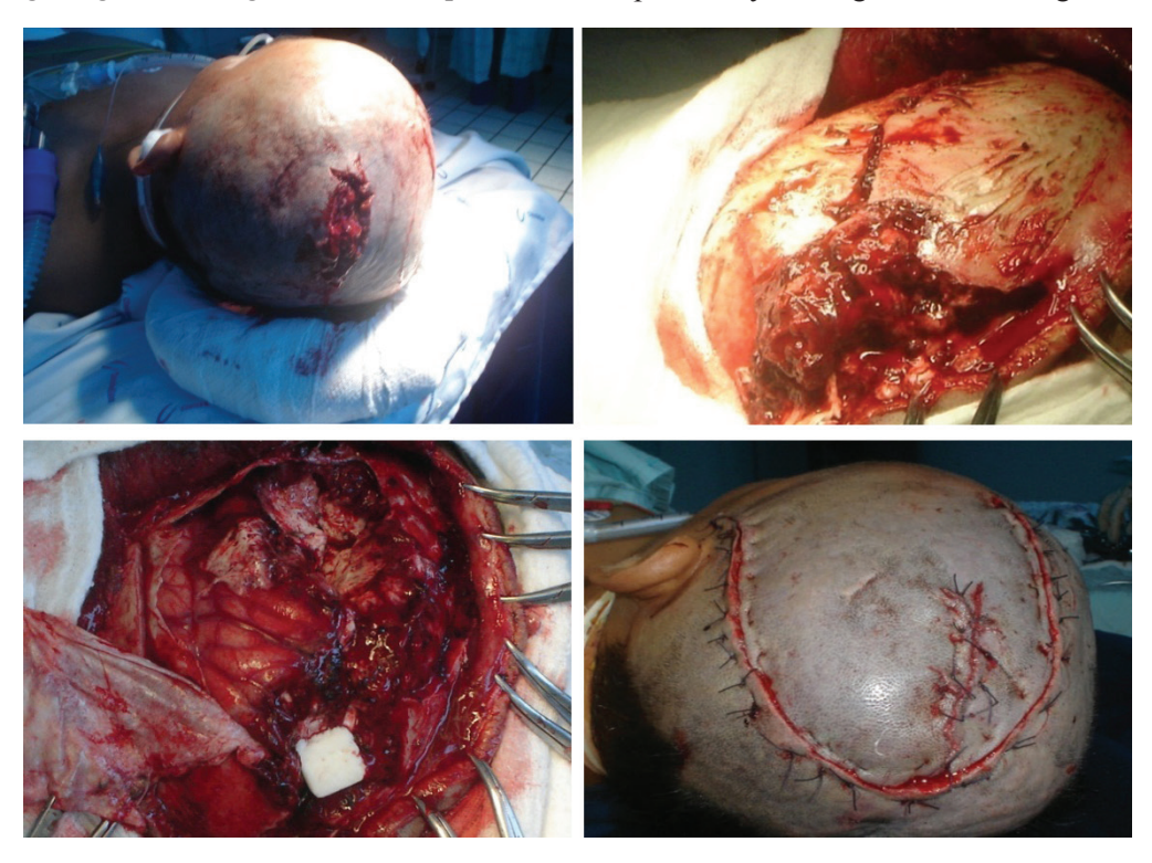
Fig. 3 . Adult male victim of CGI during assault; patient received prompt transfer to our emergency service, receiving vigorous resuscitation despite GCS of 5 (E1V2M2) and emergent damage control neurosurgery. A. Image showing the inlet hole of CGI in left parietal region with perilesional tissue devitalization. B. comminuted left skull associated to dural tear, brain laceration and output of macerated brain parenchyma. C. Postoperative image of subtotal left fronto-parietal lobectomy with drain of left intraparenchymal hemorrhage; also evidence a blunt and congestive hemisphere. D. Incisional raffia with Corachan points.

The management of CSF fistulas should be early to prevent infections; regarding the choice of closure techniques and the material used is familiarity and experience of the treating neurosurgeon, although preferably autologous fascia lata graft or pericardial